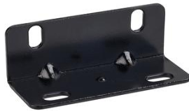
CB90BK 90 Degree Corner Bracket Adjustable 3/4" x 3/4" x 2"