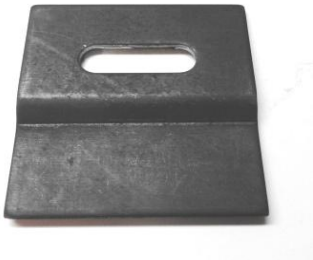
Frame Clip Brackets Available in Various Sizes