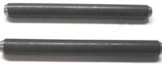
P1TZ/P811 Bed Pin 3/8" x 4" Tapered Edges Zinc