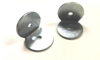
CB67P Corner Bracket 1.07" x 1.07" 14GA Steel Plain