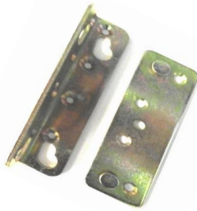
BF132MMYZ Bed Fitting 132mm Length Yellow Zinc Set of 8