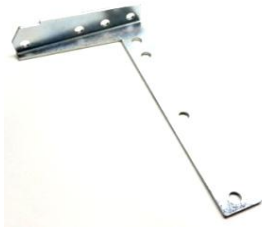
BKT1LZ Bracket 1 Left Hand 13 GA