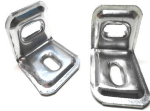
BKT1X125/ADJZ Bracket 1" x 1-3/16" x 1- 1/16" Thickness 90 Degree Adjustable Zinc