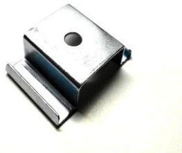
BKT-PRINT783 Seismic Bracket Print # 783