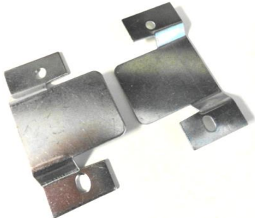
BKT3Z Bracket Sectional Connector 4" x 2-3/8" 15GA