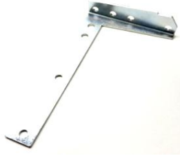
BKT1RZ Bracket 1 Right Hand 13 GA