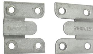
PC1 Panel Clip Zinc Plated