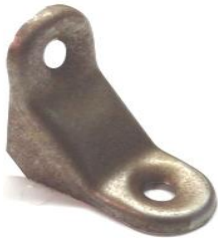
TCB137X137 Table Corner Brace 1-3/8" x 1-3/8"