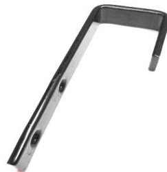
BLH5 Bunk Bed Ladder Hook Vinyl Coated