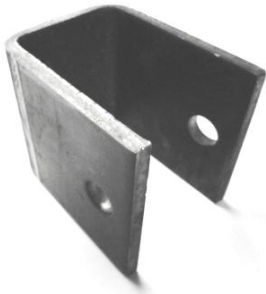
Spring Hangers Available in Various Sizes