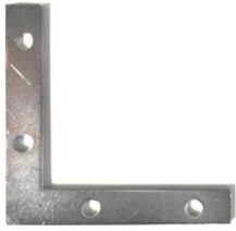
FB3X3SEZ/12W/14GA Flat L-Bracket 3" x 3" Square Edge 1/2" Width Zinc