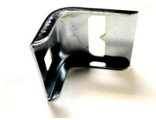
16GAVBUZ/P645 16 Gauge V Buckle Steel Zinc