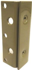
BBSH-TAN Bed Bracket Support Hardware Tan