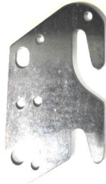
CSBB7H-ZINC Claw Style Bed Bracket 7- Hole Steel Zinc