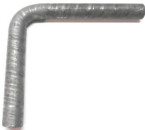
P3M/P814 Chain Rod Pin 7/16" x 3-1/4"