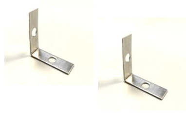
BKT5/P786 Bracket 5 Extra Firm Support Bracket Alluminum