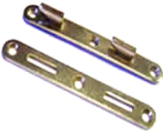
BF11/16X5/RE Bedrail Bracket 11/16" x 5" Set of 8