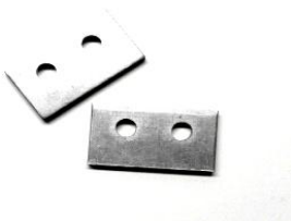
BKT6/P787 Bracket 6 CornerSupport Bracket Alluminum