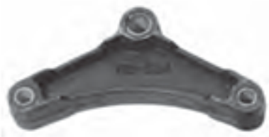
CAST IRON EQUALIZERS Available in Various Sizes and Dimensions