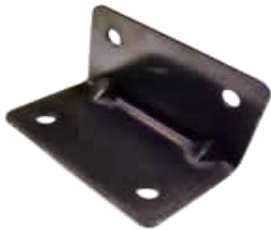
CB89BK 90 Degree Corner Bracket 1" x 1" x2" Tall Black